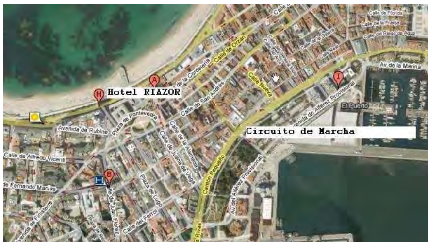
HOTEL RIAZOR.- Avda Barrié de la Maza 29, 15004 A Coruña Telefono 981 253400