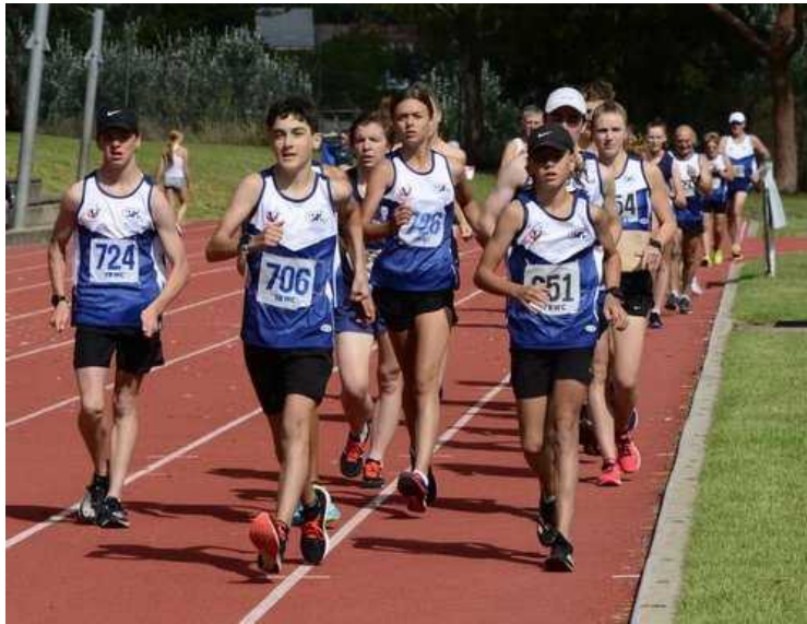
A sea of VRWC singlets