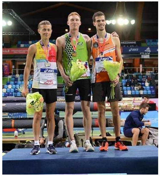
The two French Indoor Walk Championship podiums