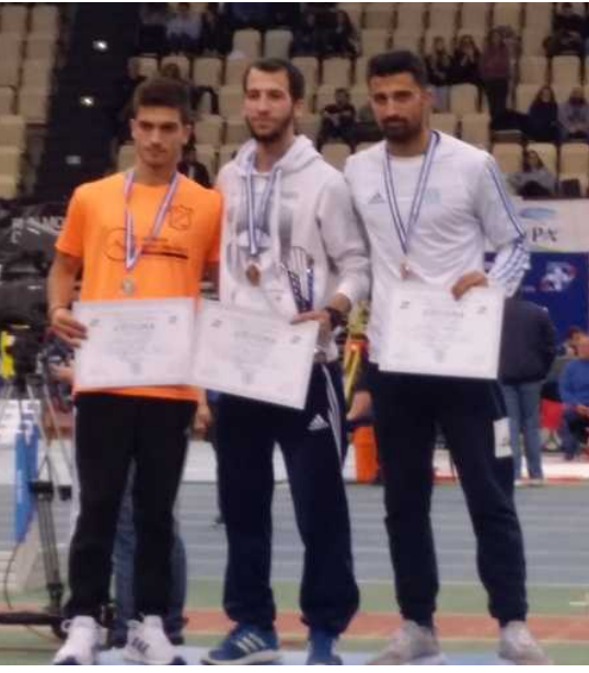
Men's and women's fields and podium placings