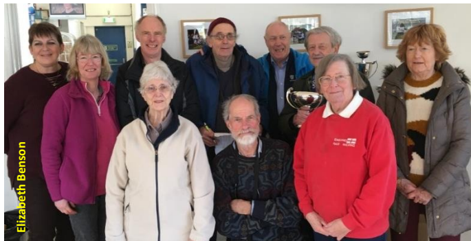
Ready to go again; some of the dedicated officials who make the ERWL possible.

The team competition has the potential to be one of the closest ever because five teams have squads large enough to score heavily and consistently. Enfield and Ilford have taken the lead, but Belgrave and Ashford are within easy touching distance despite not fielding six athletes.