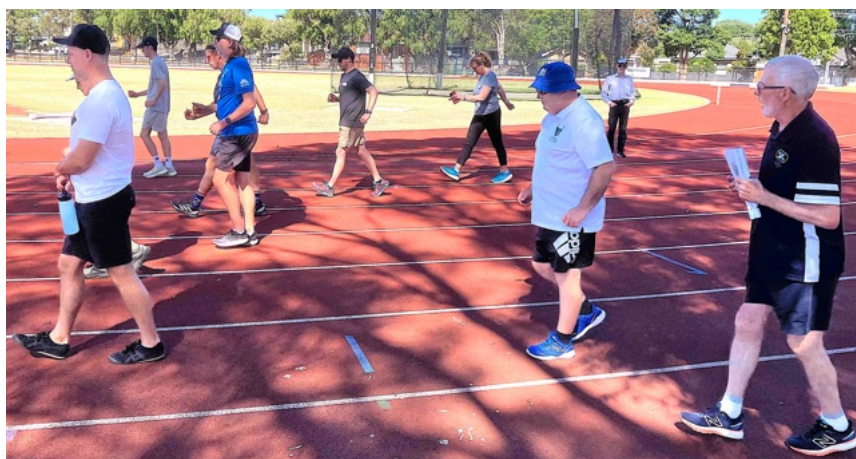
Practising low foot recovery ... the 'scrape' technique.