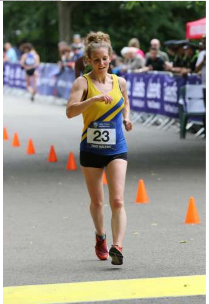
Winners of the 2019 British Grand Prix of Race Walking