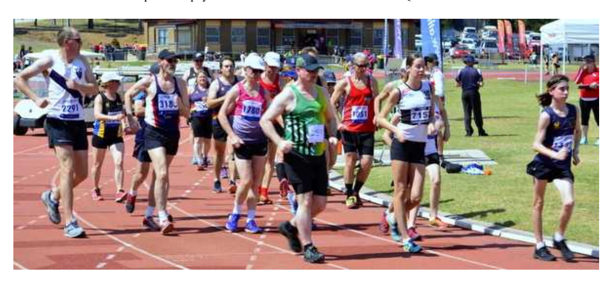
The 2000m walk gets underway at Aberfeldie on Saturday