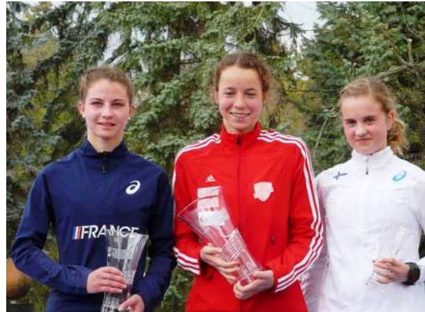
U20 podiums