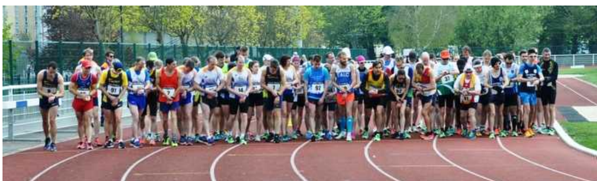
Walkers get underway in Montreuil