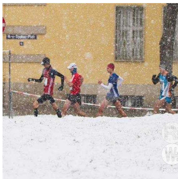
Action in the snow at the German 20km championships in Naumburg