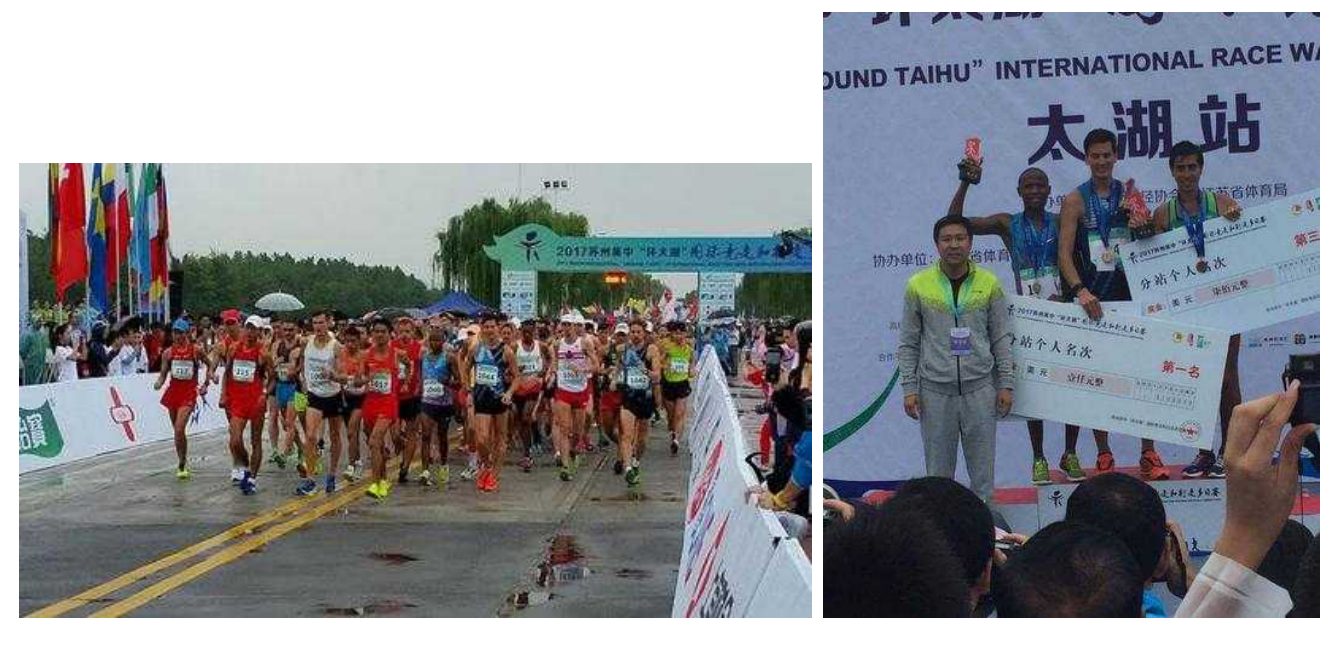
Right: the men's podium on day 1