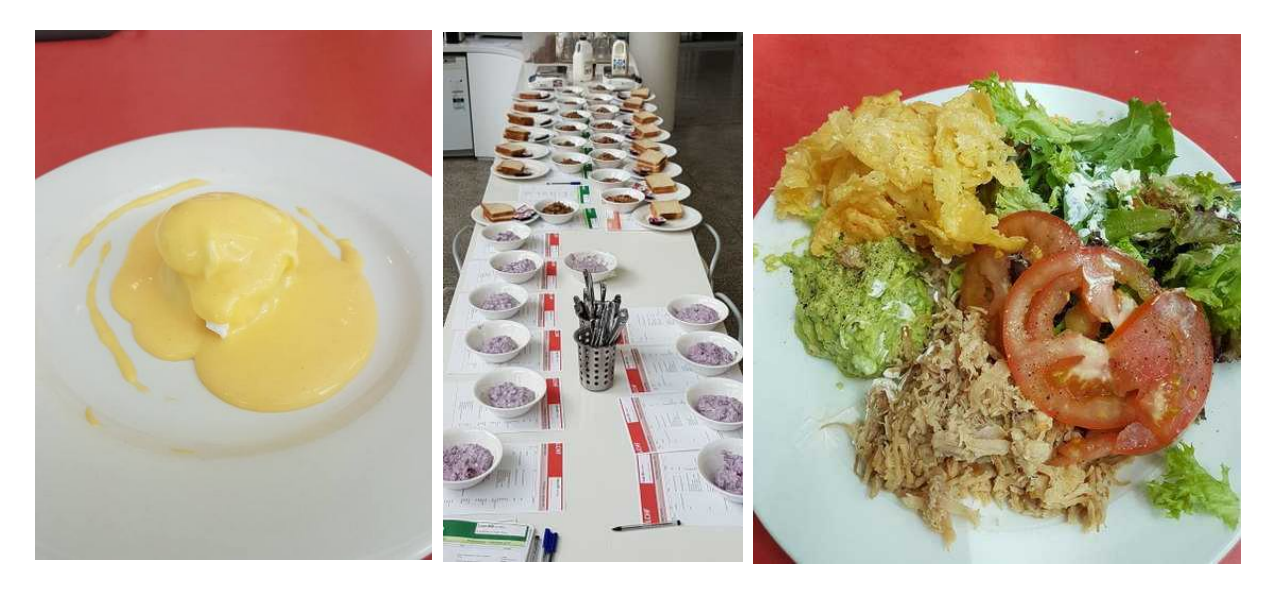
weighed to the gram, with micro- and macro-nutrients precisely calculated for each athlete

differently, and international stars Evan Dunfee and Brigita Virbalyte have still pumped out some impressive workouts. But, like in Supernova 1, the LCHF have dropped off the high-carb group to the tune of about 7%.