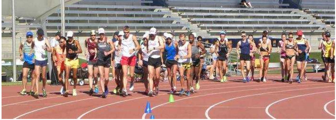
ready .. set ... go